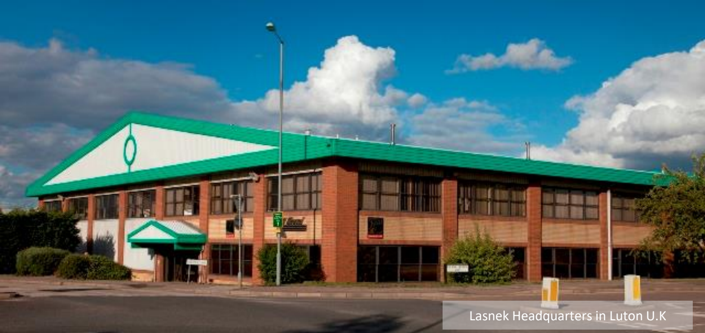
Lasnek Headquarters in Luton U.K