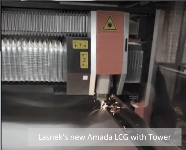
Lasnek's new Amada LCG with Tower

“We planned to replace our older punching machines with new automated laser cutting systems and as part of this we evaluated laser programming software that was available to run the new equipment.