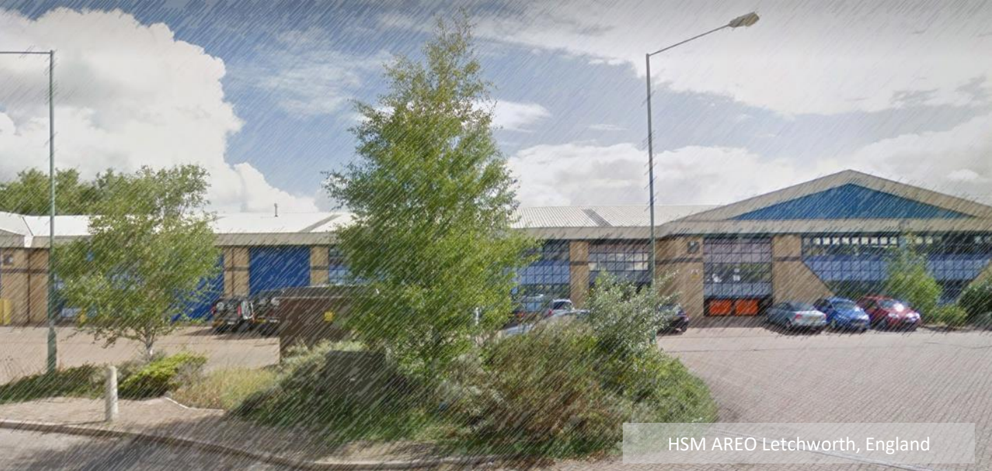
HSM AREO Letchworth, England